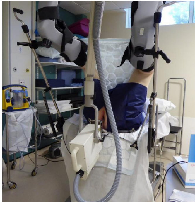
Figure 2. Treatment set up position